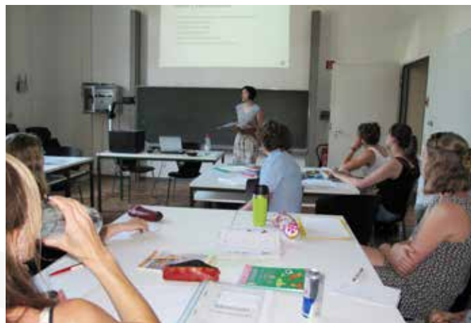
Second seminar date „Teaching English in Laos“