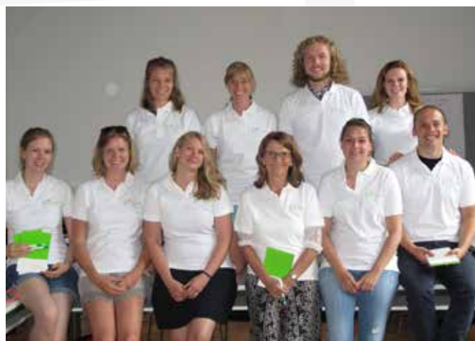
Third seminar date „Teaching English in Laos“